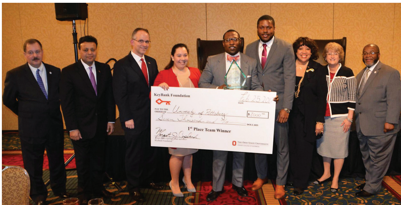
KeyBank Foundation and The Ohio State University partnered to host the 13th annual KeyBank and Fisher College of Business Minority MBA Case Competition in Cleveland, Ohio.