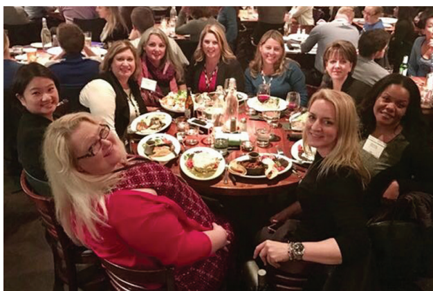
The Women’s Networking Forum provides an atmosphere where CBRE women can meet to share best practices, explore new ideas, and build their business skills.

Employee networking groups are one of CBRE’s key diversity initiatives, and the Women’s Network is only one of seven. Additional groups are: African-American Network Group, Asia Pacific Network, CBRE Military,