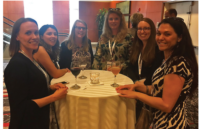
Female attendance hit nearly 40% at SVN's national training session for brokers in Chicago in 2017.