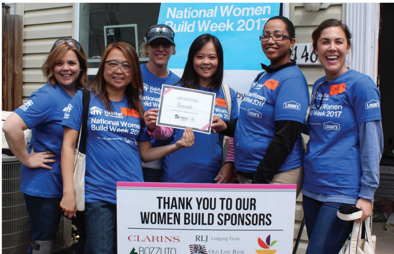
Women of Bozzuto Construction Company volunteer at National Women Build Week 2017