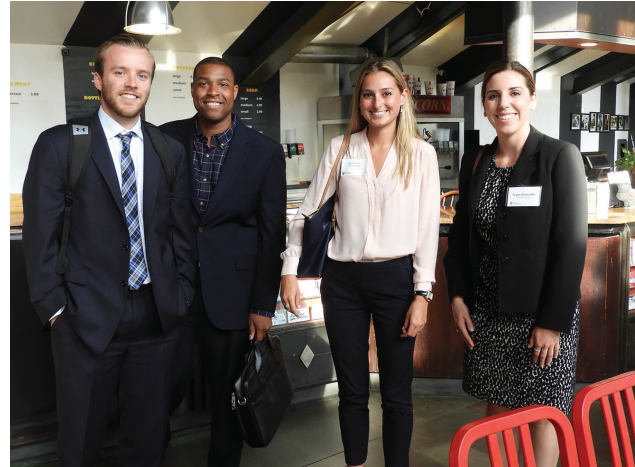
Attendees at the showing of the movie, Girl Rising, sponsored by the Miles & Stockbridge Women's Network and the firm's Social Impact Committee.

Law360, a legal news service, ranked Miles & Stockbridge second in the nation in 2016 on its list of "Best Law Firms for Black Attorneys." The American Lawyer , a monthly magazine for the legal profession, recognized Miles & Stockbridge as one of the firms on its 2017 Am Law 200 list with the highest percentage of African-American attorneys. In the spring of 2017, the firm was one of six finalists from around the country honored for diversity efforts by a large financial institution client. In