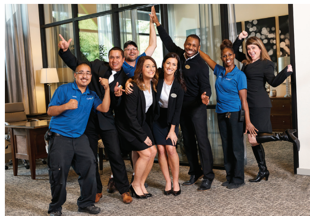
Camden’s front line employees love taking care of their customers.

A few examples of how Camden has supported this philosophy is increasing diversity on its board of