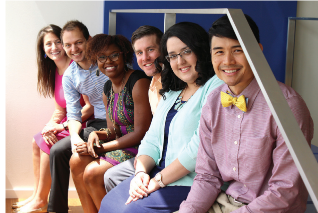
Camden’s future leaders

Because Camden hires and promotes internally based on a team member’s demonstrated abilities, the firm appeals to female candidates. They can be confident in the knowledge that their career progression will be