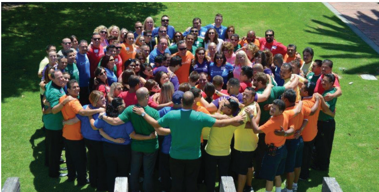
Camden's tight-knit culture